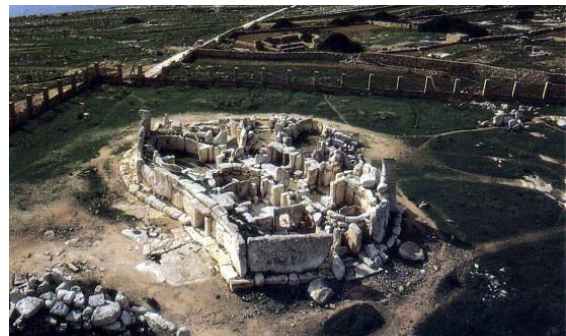
Aerial picture of Hagar Qim

We look forward to warmly welcome you in September 2011 in Malta!