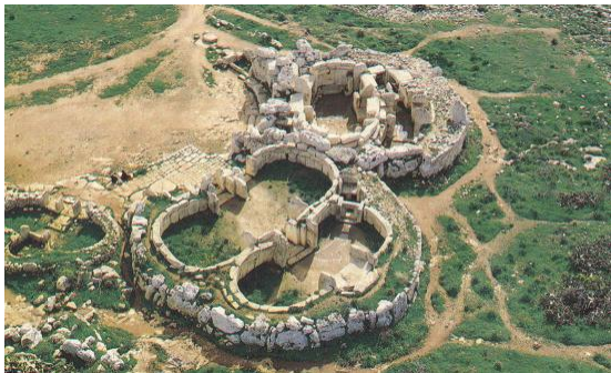
Aerial picture of Mnejdra

This guided tour will take all participants for a walk through Malta's 8,000 years of history. The visit will start first with the marvellous complex of Megalithic temples at Hagar Qim//Mnajdra located on the cliffs overlooking the Mediterranean Sea on the south west coast of Malta. These are some of the oldest standing structures in the world, dating back 5,000/6,000 years before the Christian era. Then, back to the coach to the centre of Malta, to visit the Domus Romana at Rabat, a beautifully restored Roman country residence. From Rabat, we will go for lunch at the Radisson Hotel, which overlooks the Golden Sands Bay, one of the four sandy beaches in the North West coast of Malta. After lunch, the tour continues to Mdina, the old capital of Malta. Mdina, known locally as the silent city, was first built around 4,000 years ago. During the Roman period the city was called Melita but this was changed to Medina during the Arab period. When the Arabs took over the city, they reduced its size and surrounded the city by massive fortifications. It contains several palaces, churches and other buildings all dating back to the middle ages and beyond. Mdina is a unique example of a fortified hill-top medieval city and has recently been restored to its past glory. After the visit to Mdina, the coach will be leaving at 16.30 hours and be back to the hotels at 17.00 hours.